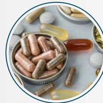
NUTRACEUTICALS AND SUPPLEMENTS