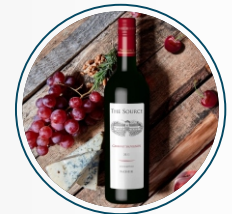
WINES, SPIRITS AND OTHERS