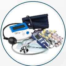
PHARMACEUTICALS, BIOTECH & MEDICAL DEVICES