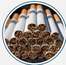
TOBACCO, CANNABIS, AND E-CIGARETTES