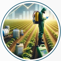
CHEMICAL AND AGROCHEMICAL PRODUCTS