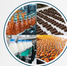
FOOD AND BEVERAGES